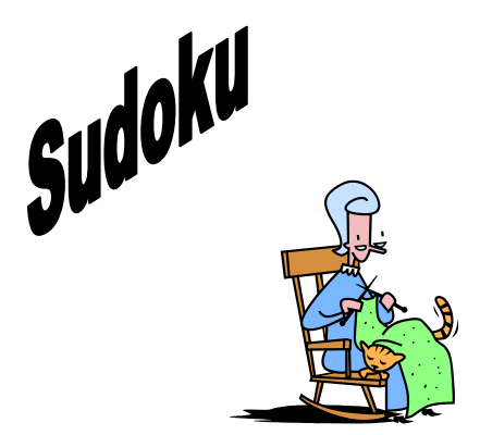
I can rock but roll just left town!

We are giving free accommodation (apartment for 4-6 persons) during Pula Bridge Festival to one US junior team. Festival is one of the biggest in Europe (over 100 teams, about 250 pairs). If interested, contact me for details (tihana@pilar.hr)