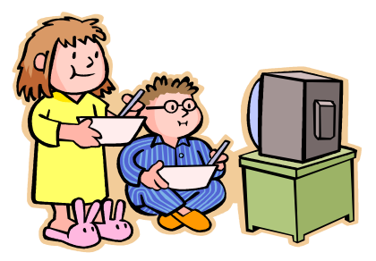
I love watching in my jammies!

10:00 - 12:10: Segment 1 12:20 - 2: 30: Segment 2 3:40 - 5:50: Segment 3 6:00 - 8:10: Segment 4