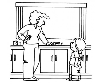
"How long did yar intern with Grandma before you became a full-fledged Mom?"