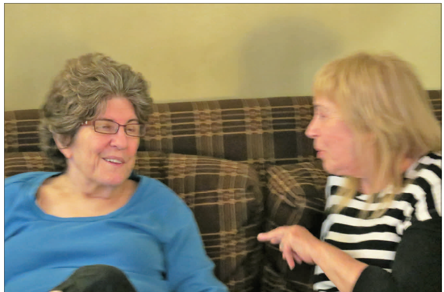
Brenda explains to Sally: I'm not Kit. You can raise my preempts!