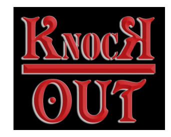
Photo from Tuesday's Captain's Meeting where the matches were determined. The top Round Robin finishers chose their opponents... sometimes that works ... and sometimes it is regrettable. Good luck to everyone! Let the knockout phase begin!!