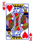
Hearts & Flowers

SALOON SHERIFF SHOPKEEPER SITTING BULL STAGECOACH TELEGRAPH TRACKER TRAIL TRAIN UNDERTAKER WATER TANK WELL