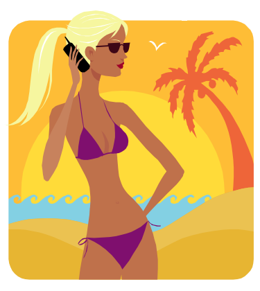
One blonde to the other: So how come the sun makes my skin darker and my hair lighter??

"I finished the exam in half an hour, but now I'm rechecking my answers."